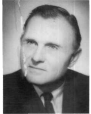
Paul Twitchell, modern-day founder of ECKANKAR, Religion of the Light and Sound of God.

If you want more love, joy, and grace in your own life, you could benefit from reading this book.