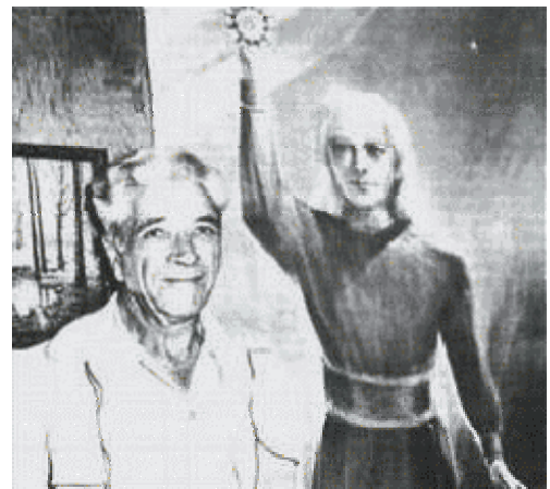
George Adamski, standing by a painting of one of his "contacts" from Venus

Together we left the lobby, I walking between them. About a block north of the hotel, they turned into a parking lot where they had a car waiting. They had not spoken during this short time, yet inwardly I knew that these men were true friends. I felt no urge to ask where they proposed to take me, nor did it seem odd that they had volunteered no information. An attendant brought the car around, and the younger man slid into the driver's seat, motioning me to get in beside him. Our other companion also sat with the front seat. The car was a four-door black Pontiac sedan. The man who had taken the wheel seemed to know exactly where he was going and drove skillfully. I am not familiar with all the new highways leading out of Los Angeles, so I had no idea in which direction we were