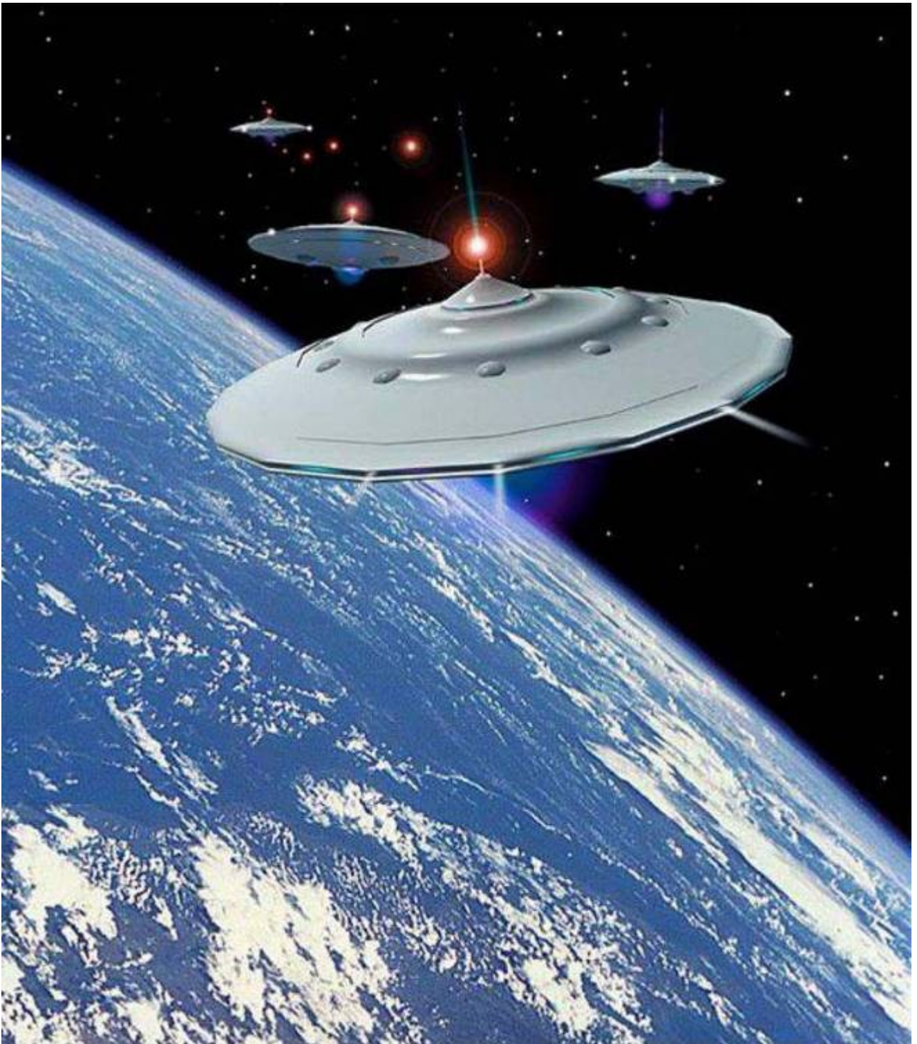
Small spaceships of the Metharia civilization (see pic. 277 at www.cosmic-people.com )